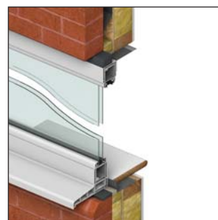
Fig 2 Expansion and compression of TP450 Compriband Timber Max after frame movement