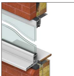
Fig 1 Location of TP450 Compriband Timber Max at initial installation

Safety data sheet must be read and understood before use.